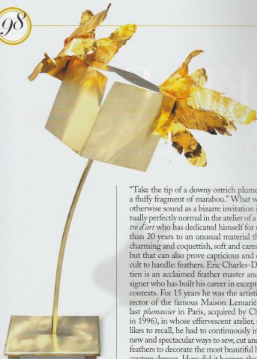
"Madlight" is a lamp inspired by the light produced by candles; the feather wings evoke purity and freedom. Right, a dress by Christophe Josse (2011), decorated with hand-painted feathers.