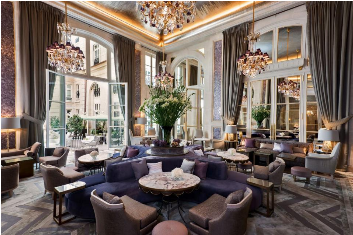
The hotel's Jardin d'Hiver - The Les Ambassadeurs bar