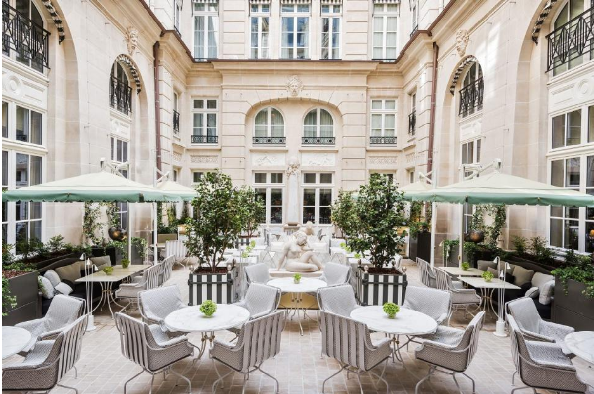
The Louis Benech–designed Cour d'Honneur

Opinions expressed by Forbes Contributors are their own.